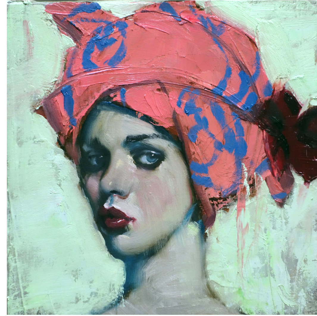
Pink Bandana, 2016 9 x 9"