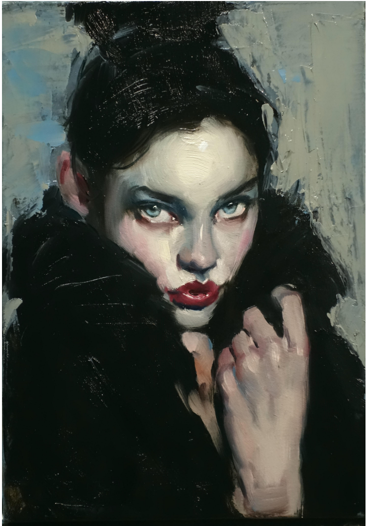
Black Cape, 2016 12 x 8"