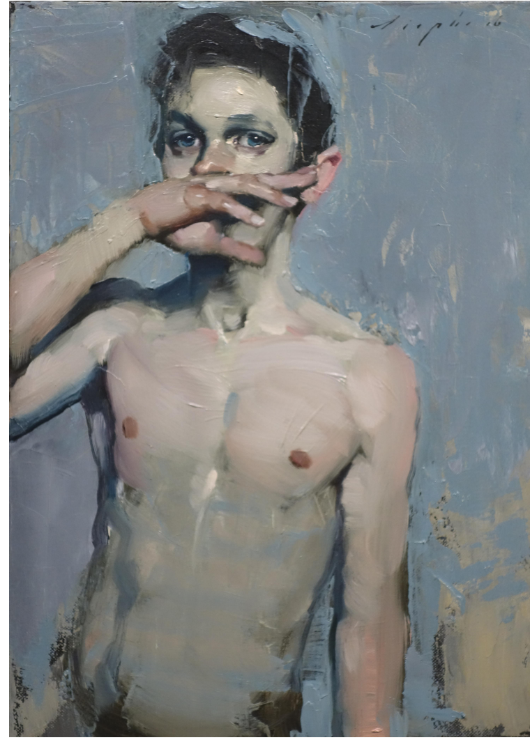
Tough Kid, 2016 14 x 10"