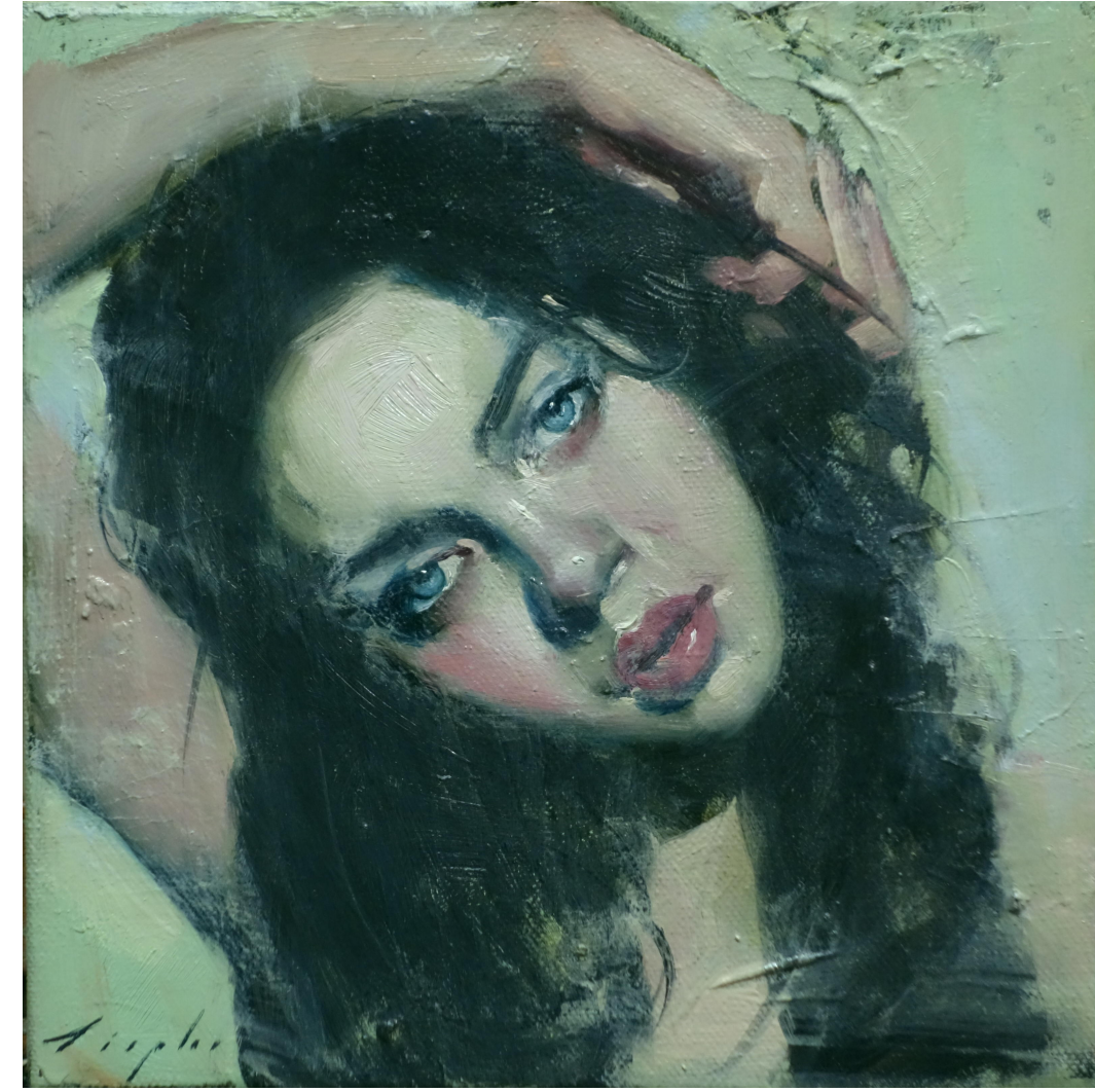
Tilted Head, 2016 8 x 8"