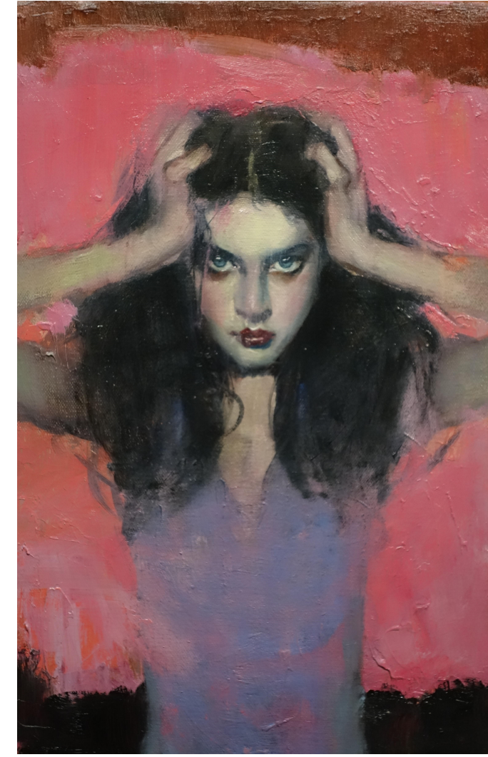
Hands On Head, 2016 20 x 10"