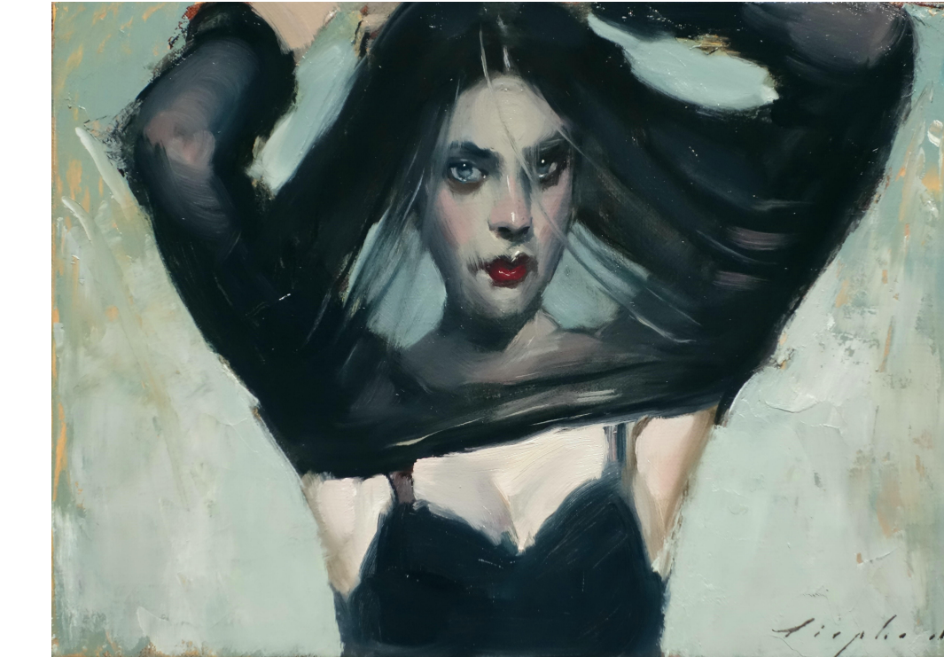
See-Through Blouse, 2016 9 x 14"

NIKOLA RUKAJ GALLERY 384 Eglinton Avenue West, Toronto ON M5N1A2 (416) 481-5995 rukajgallery.com