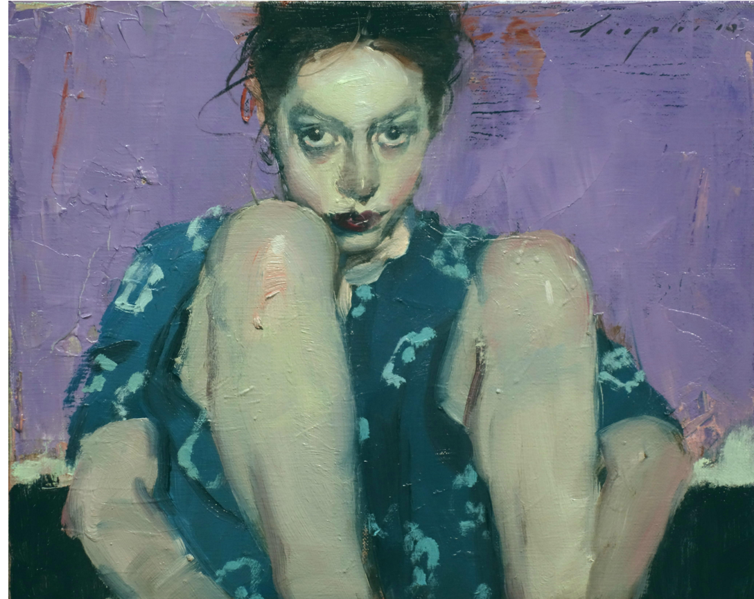
Up Close, 2016 10 x 12"