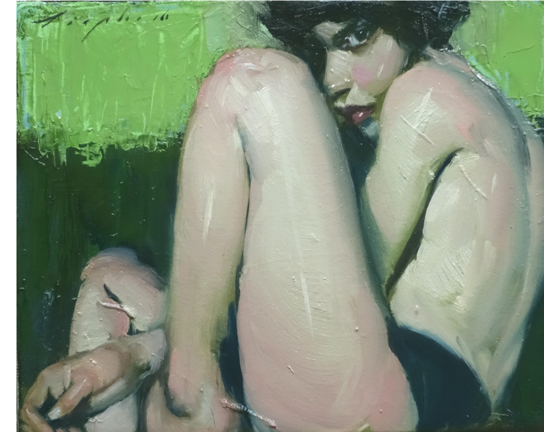
Curled Up, 2016 8 x 10"