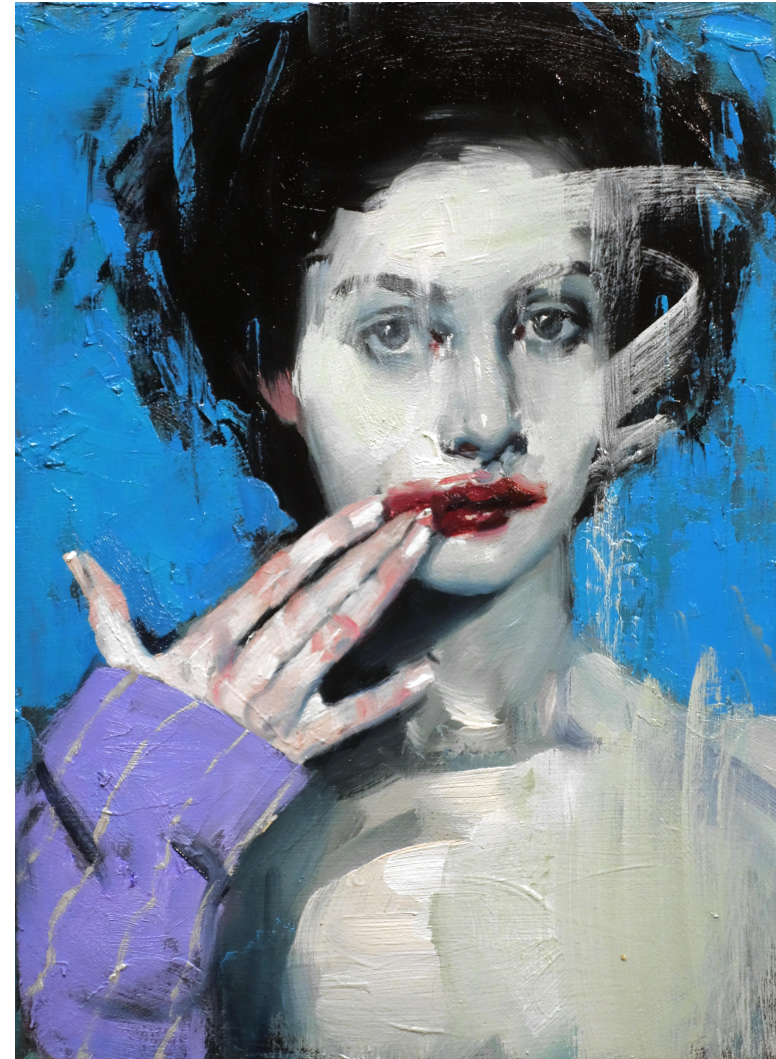
Smudged Lipstick, 2016 12 x 9"